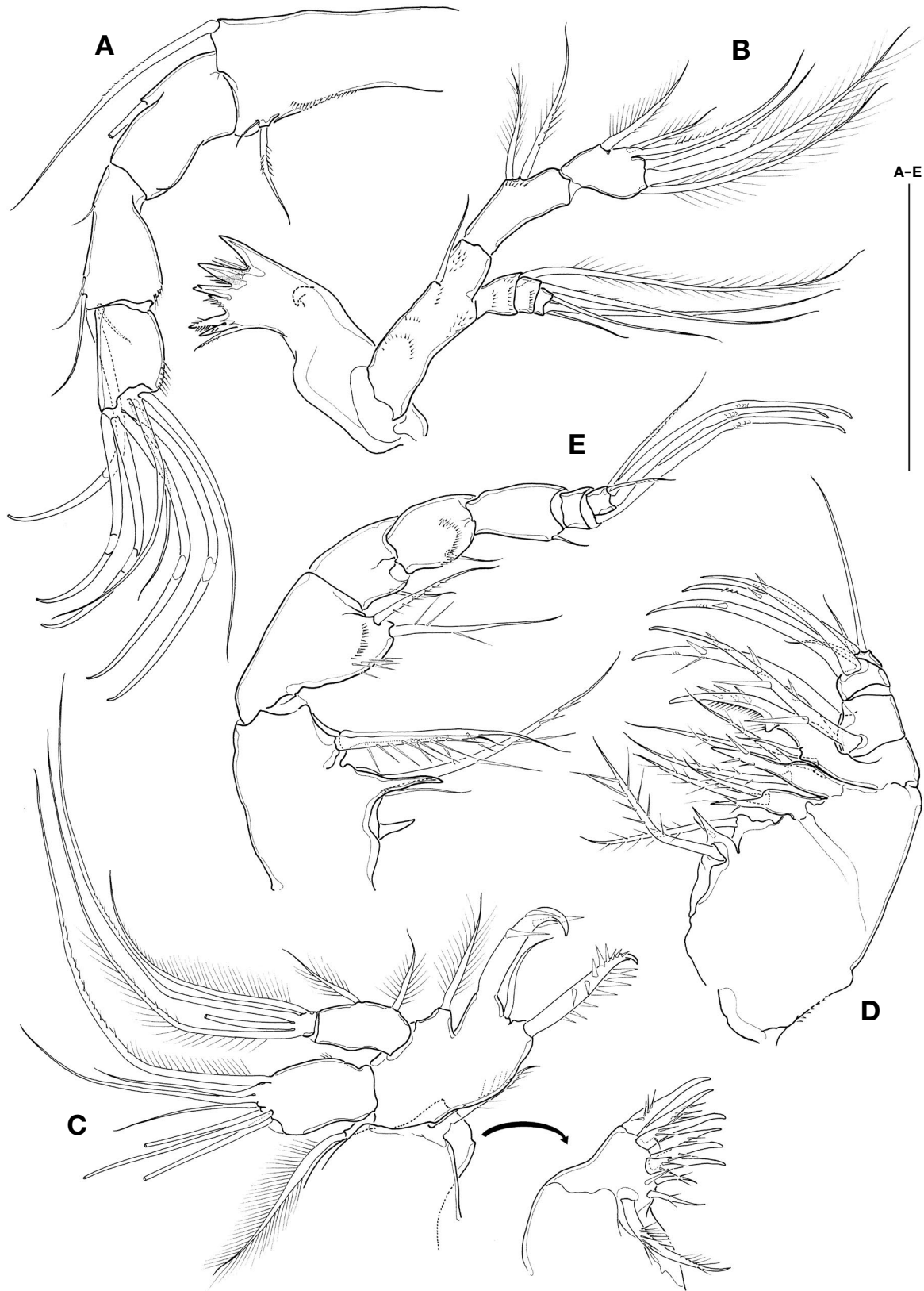
Fig. 2. Cyclopinopsis deformata n. sp., female. A, Antenna; B, Mandible; C, Maxillule; D, Maxilla; E, Maxilliped. Scale bar: A-E= 50 \mu m.